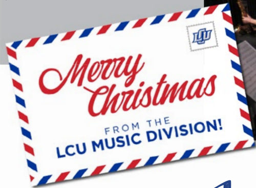
(Right) Online Christmas Concert